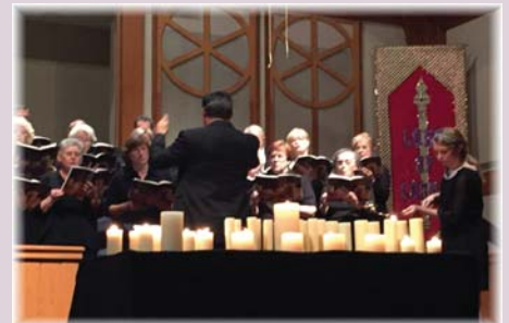
Photo from the 2016 Tenebrae Service

Our Sanctuary choir will lead the congregation in a Tenebrae Service on Palm Sunday, March 25, during the morning worship service. It will include a silent communion as part of the program in the darkened Sanctuary. This is a meaningful service that will prepare your heart for the Easter season. Please invite your friends to join you for this very special service.