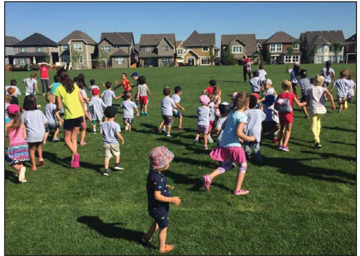
Photo of children at the camp operated with FBCHHI Volunteers last summer in Calgary, Canada

Our church has scheduled another mission trip to Calgary, Canada, this summer. As in the past two summers, we will send a mission team to help with some outreach camps for children. The dates for the trip are July 28 through August 4, 2018. We ask that you keep our Mission team in your prayers for a safe trip and more importantly, that their witness will touch many lives for Christ while there.