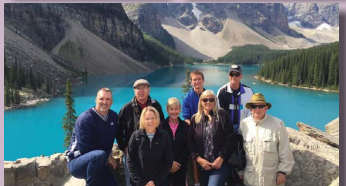
Photos of last year's Mission Team and VBS Style Camp in Calgary, Canada